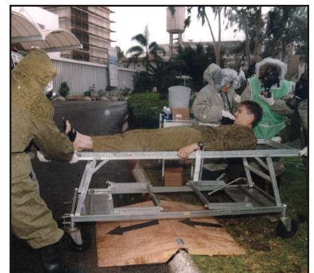
RMC conducts regular exercises to prepare for all emergencies, especially those related to war and terrorist attacks. Above, the staff of RMC is engaged in preparations for providing medical assistance in the event of chemical warfare.