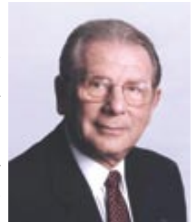
Alfred E. Mann

he was named Person of the Year by Time magazine, knighted by the Queen of England, dubbed "Rudy the Rock" by French President Jaques Chirac, and former first lady Nancy Reagan presented him with the Ronald Reagan Presidential Freedom Award.