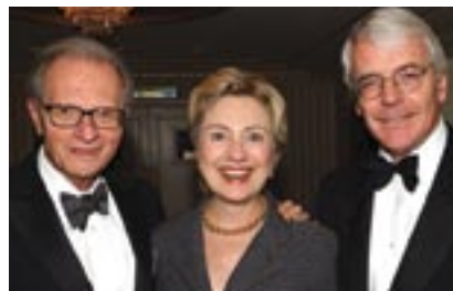
From 2003 Dinner, Larry King, Hillary Clinton and Prime Minister John Major.

Published by - Specialized Office Systems • Phoenix, Arizona • (602) 485-0900