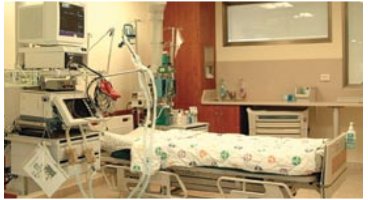
A room in the new Intensive Care Unit.

To deal with this problem individual rooms were constructed, that were open to view, and each one was fully equipped with all the necessary medical equipment, and spaced around a central nursing station where each patient is to be under constant observation and fully monitored. There is even a viewing window, with a telephone, through which family members and friends can communicate with the patient and find comfort in knowing that everything is being done and the best medical care is being given. A small area, with all the amenities, was built for family members so they now have a place where they