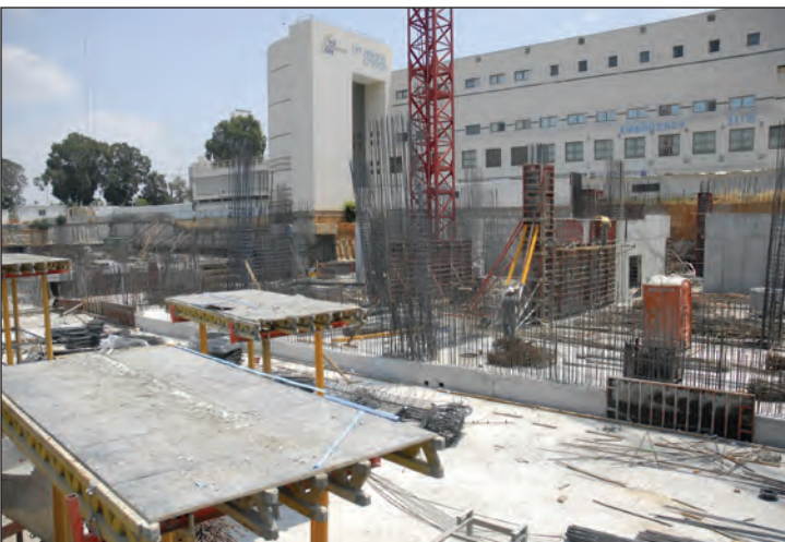
Construction of the New Jusidman Emergency and Trauma Center

A modern and up-to-date emergency department often makes the difference between life and death for those with acute injuries. The Jusidman Emergency and Trauma Center at Rabin Medical Center will replace the current facilities which are no longer suited to the needs of the more than 160,000 annual emergency room visitors. Using state-of-the-art technology and evidence-based designs, the Center will provide first-class emergency medical care while enhancing patient comfort.