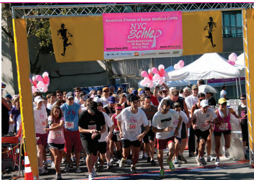
NYC Schlep 2011 starting line Sunday, July, 17, 2011, Battery Park, NYC

FIND OUT MORE: afmc.kintera.org/nycschlep2012