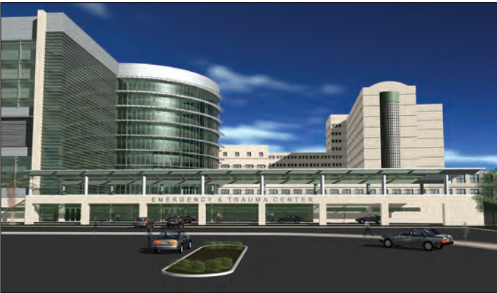
Rendering of the New Jusidman Emergency and Trauma Center