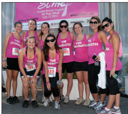
Participants in the first NYC Schlep