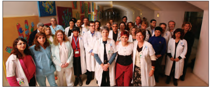
Staff of the Hemato-Oncology & Bone Marrow Transplant Department