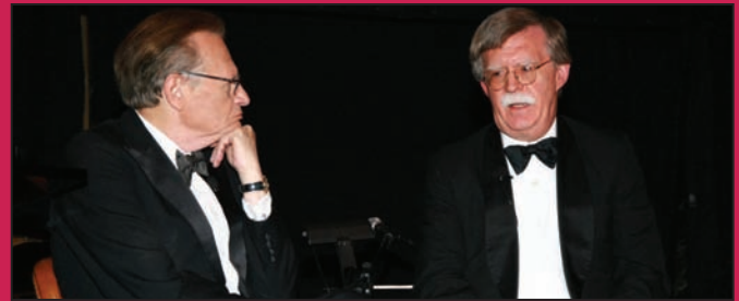
Larry King and John Bolton on stage