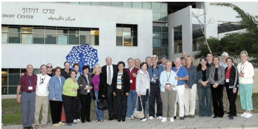
Interfaith Mission Group from New Jersey and across the USA visits RMC and pay tribute to the Trobman Family.